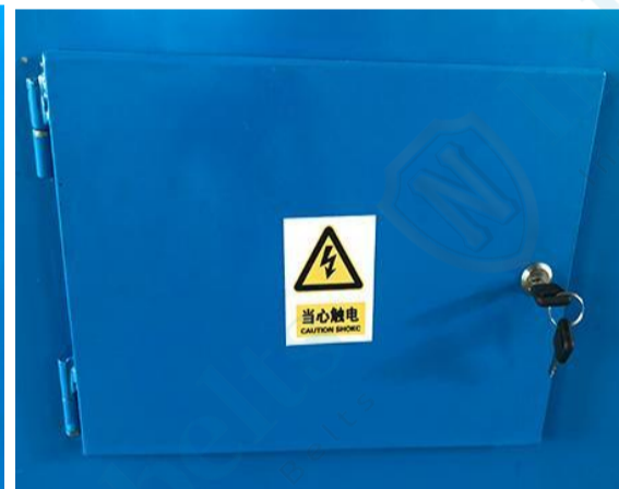
Control panel with cover door to protect the buttons