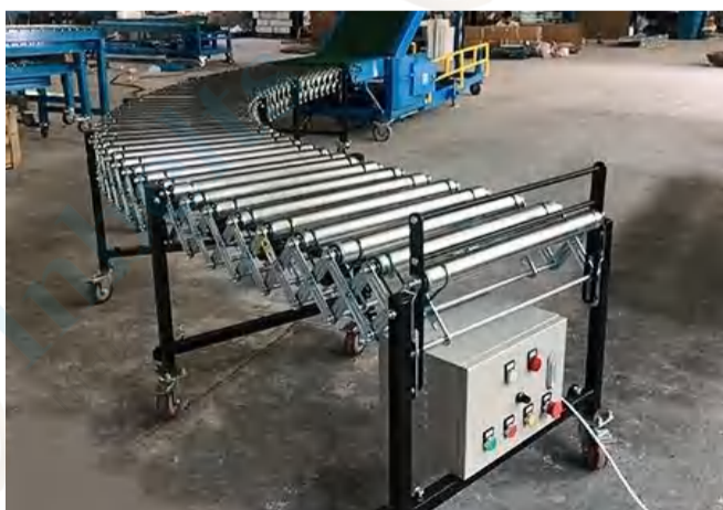
Combine with flexible powered roller conveyor to reach close to the target