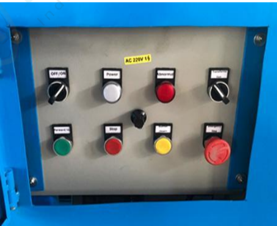
Control panel for machine