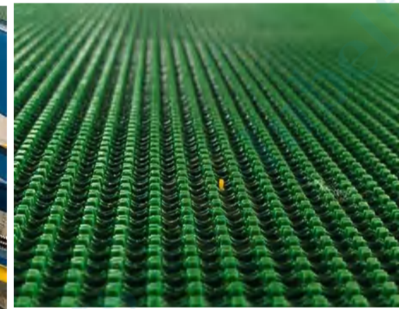
5mm thick rough top PVC belt