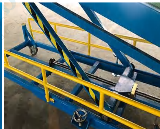
Safety guard to prevent people down into the machine