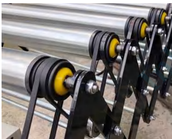
Rollers are driven by V belt