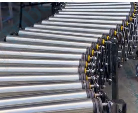
Dia 50mm galvanized steel rollers