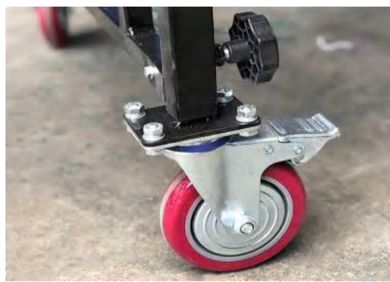
Mobile on 5" universal castors