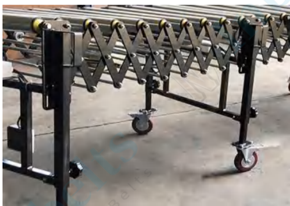
Each legs with adjustable height of 700-1000mm