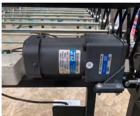
Every meter with one 90W/120W min motor