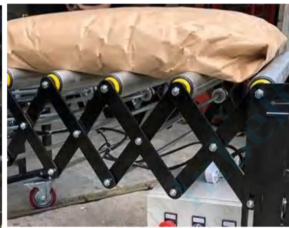
Suitable to transport paper bags