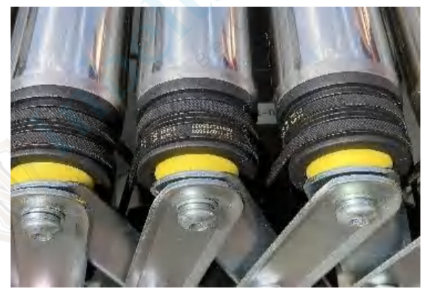
High Quality V Belt for Roller Driving