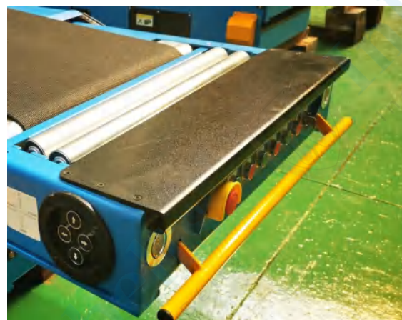
Side Control Panel: Extend, Retract, Up, Down