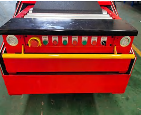
Front head control panel