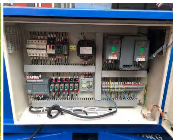
Main control box with Schneider VFD