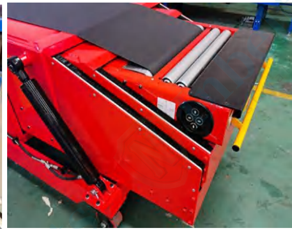
Rough top PVK material belt