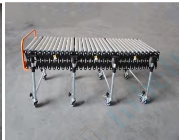
Close the conveyor when not use to save space