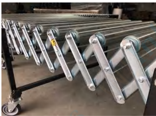
Curved galvanized flexible steel frame