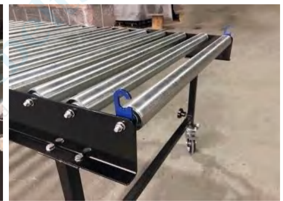
Easily joint two or more units by buckles