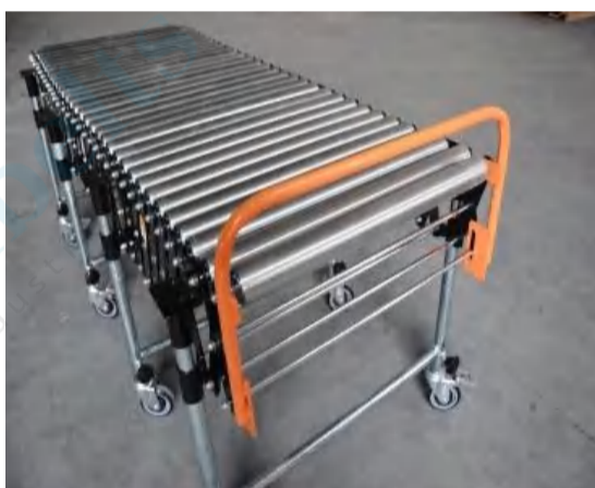
With end package stop bar