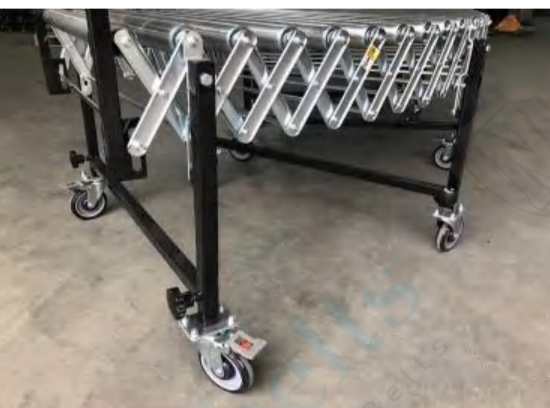
Square tube support legs