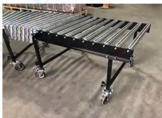
Reinforced impact section