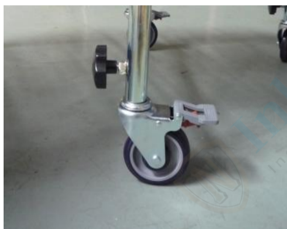
Move on 100mm swivel lockable polyurethane casters